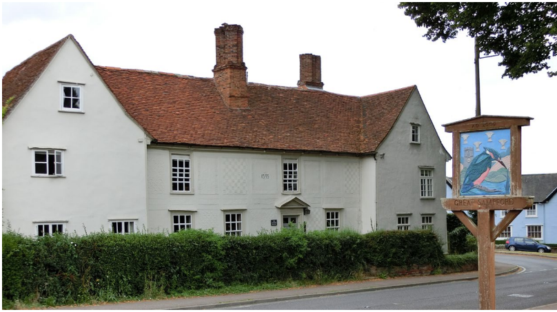
The Manor House, shown on the left, has stood opposite Great Sampford Church since 1595. The village sign is rather more recent. It matches the one below for Little Sampford which also depicts a kingfisher.